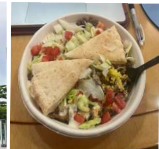
Special Menu (halal, vegetables, etc.)