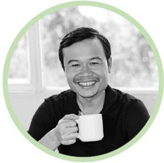
Vo Trong Nghia