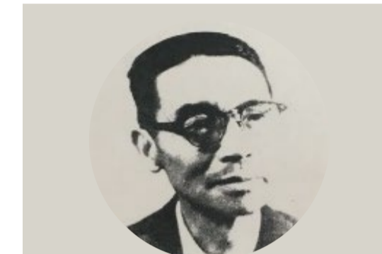
梁思成建筑奖 THE LIANG SICHENG ARCHITECTURE PRIZE

Nominations for 2020 Liang Sicheng Architecture Prize/ Selection and Evaluation for 2019-2020 ASC Architectural Design Award/ Selection and Evaluation for 2019-2020 ASC Science and Technology Progress Award