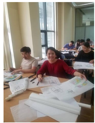
More than 140 professional architects have been trained through 8 times of professional architects training courses and training package hours in 2019.