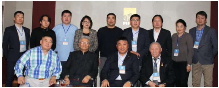
Jan 19, 2019 The 15 th Congress, UMA general assembly was held Board members UMA