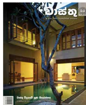
A Quarterly Journal in Sinhala named “VASTU” .