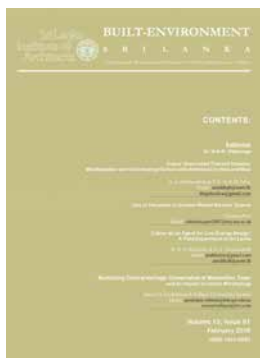
“BUILT ENVIRONMENT” Scientific Journal