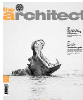
THE ARCHITECT” is a quarterly English Publication circulated locally and internationally.