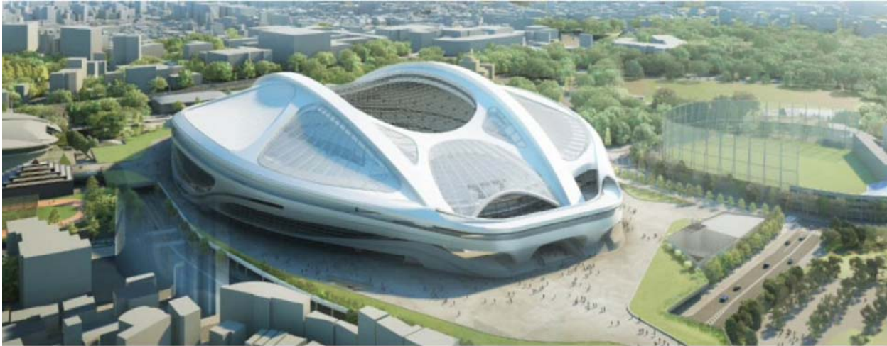
Above: Former preliminary design for the New National Stadium Japan (May 2014)

We, three recognized organizations related to the architectural design in Japan, would like to announce that we are ready to provide any supports as much as possible, if such is requested to do so, for the great success of this national project.