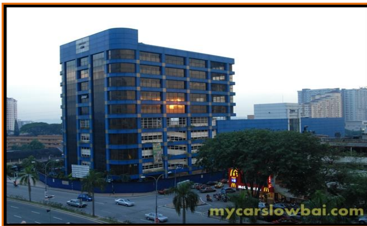
Jaya Supermarket Building Before Collapsed

There were two buildings collapsed recently in Malaysia. The collapse of old Jaya Supermarket building has taken 7 lives. The building is in demolishing stages when it collapsed on 28 th May 2009.