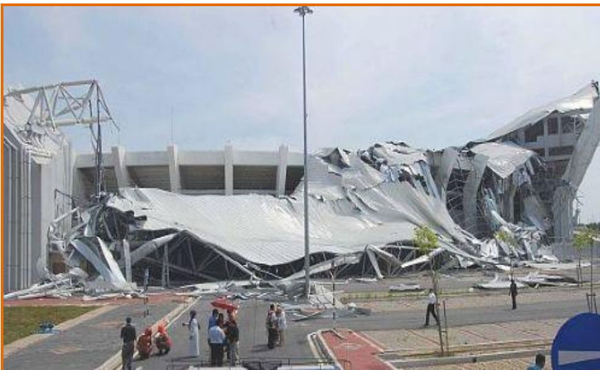
The Stadium after Collapsed (side picture)