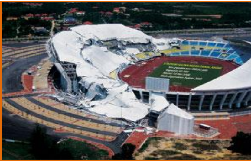
The Stadium after Collapsed