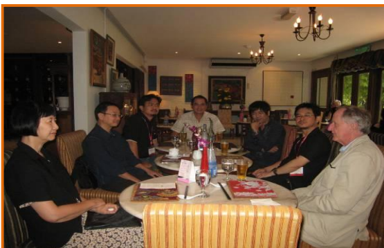
PAM Awards Judging Juries