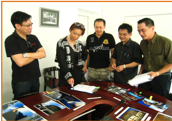
PAM Architectural Steel Award Judging Session

The bi-annual award PAM Architectural Steel Award re-visits this year. 25 entries were received and winners were announced during the Building Industry Dinner recently.