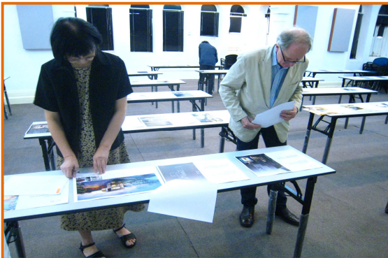
PAM Awards Judging in Session

PAM has organised 3 awards competitions, 3 design competitions and 1 photography competition. The annual PAM Awards is the most awaited award with 8 categories for this year. This prestigious award will be announced in October 2009 during PAM Annual Dinner.