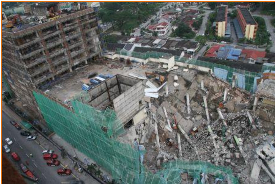
Jaya Supermarket Building After Collapsed