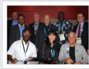
Signing of MOUs between ARCASIA and AUA and ACE (06-08-2014)