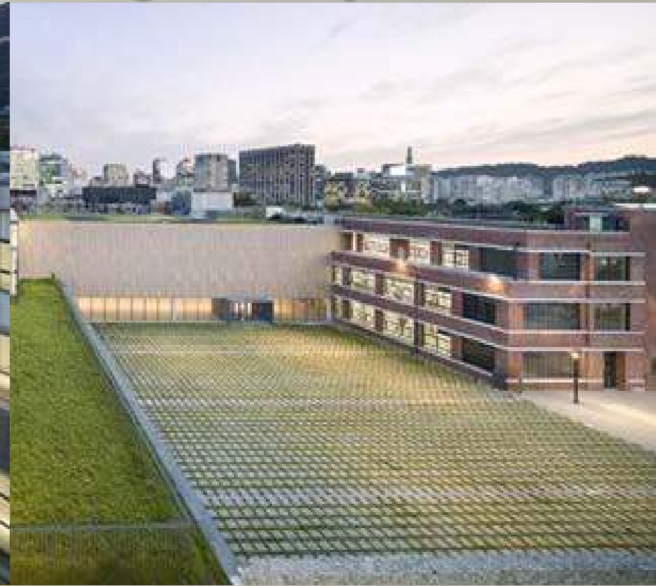
Buk Seoul Museum of Art