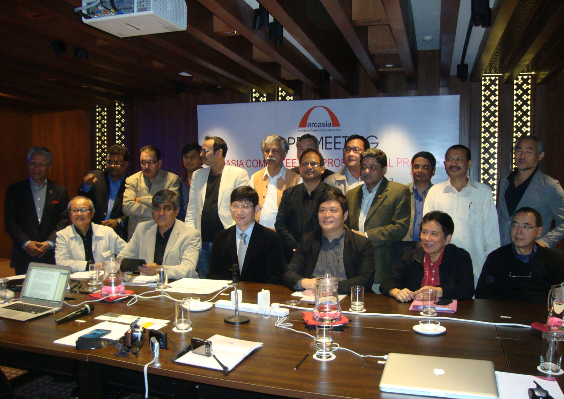
Minutes / Report of ACPP Meeting 2013, Katmandu held on 5 th Oct 2013