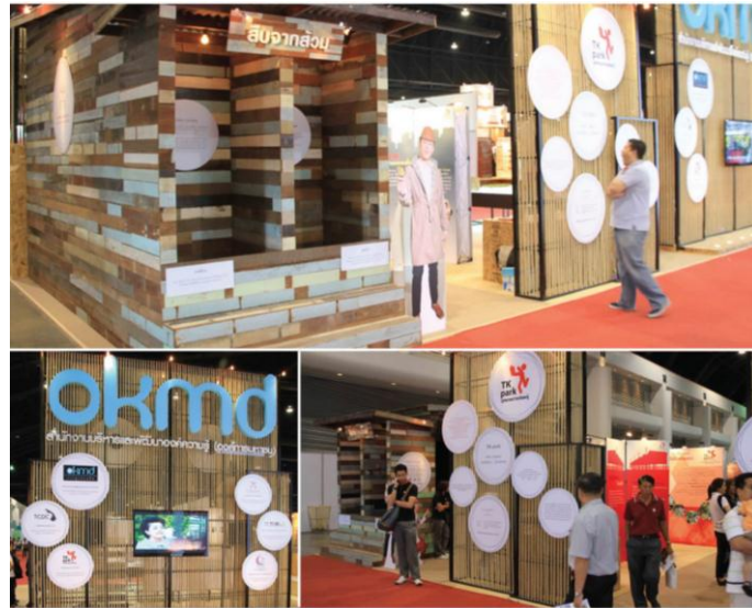
Other Related Associations : TIDA, OKMD, DPT, ISIT