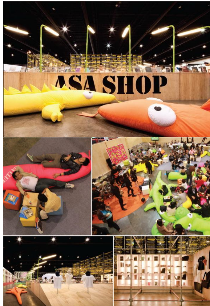
ASA Shop / ASA Club