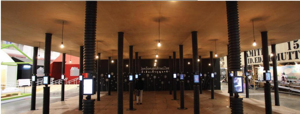
Unlock Thai Identity : 2 nd Year Exhibition