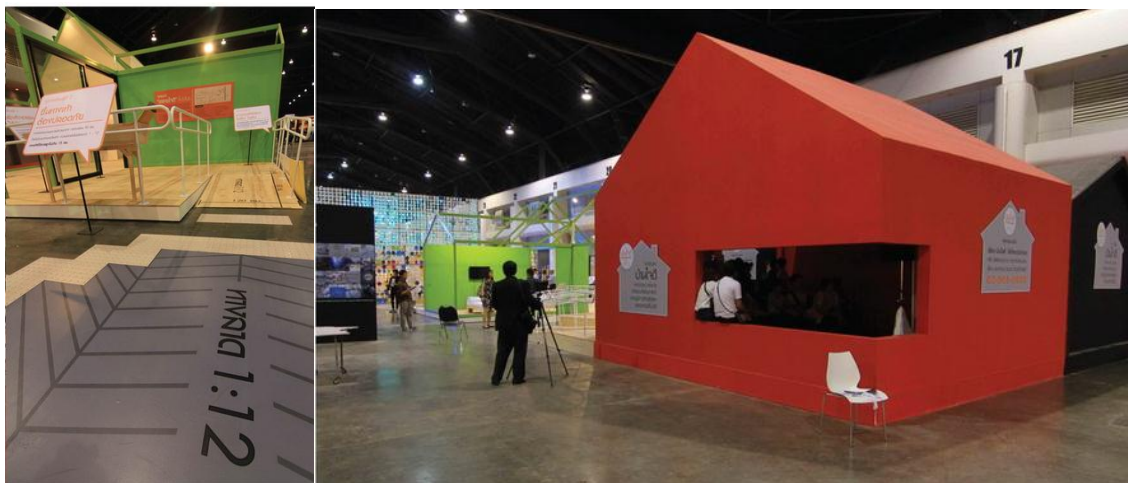
Kind Heart House : Universal Design Exhibition