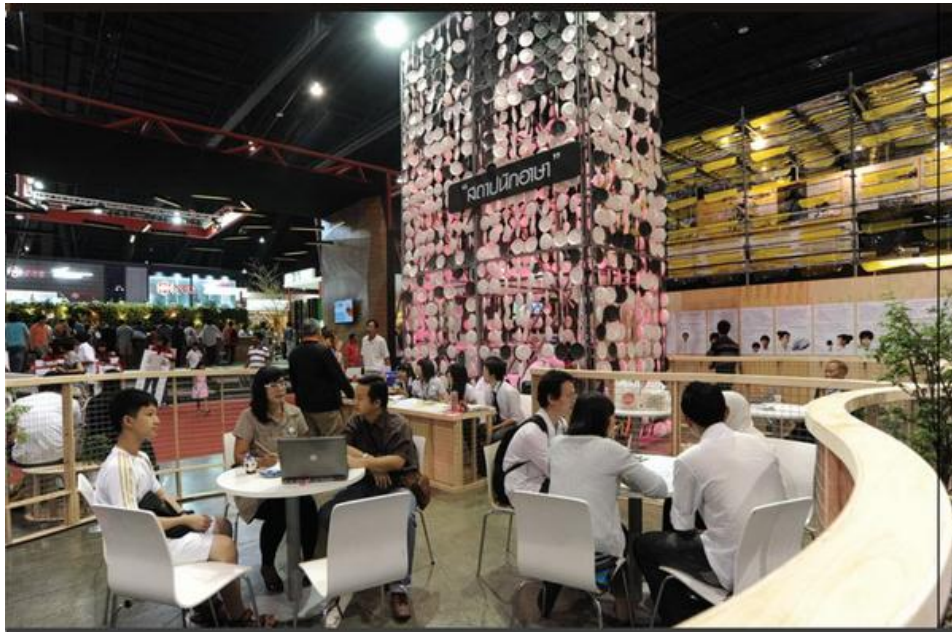
ASA House Doctor