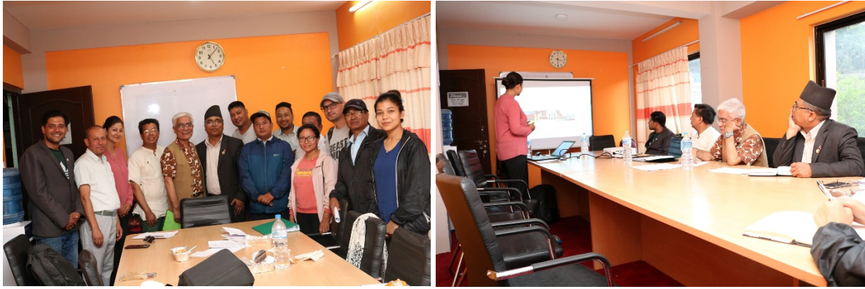
Fig: Meeting held at Kirtipur Municipality regarding implementation of ERA guideline