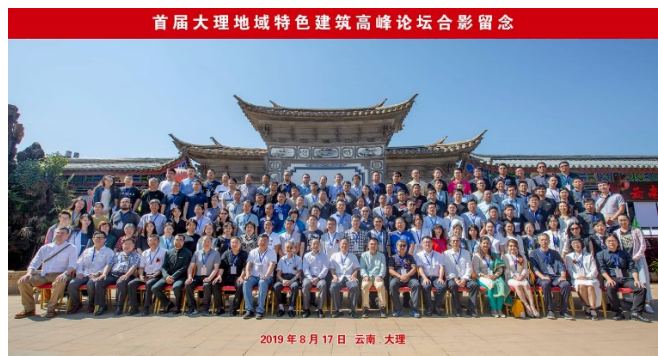
Fig: Participation on ‘1 st International Summit Forum on Region-featured Architecture’ at China