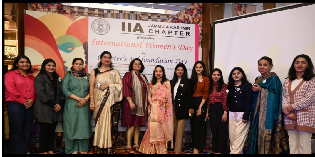
IJA JAMMU & KASHMIR CHAPTER