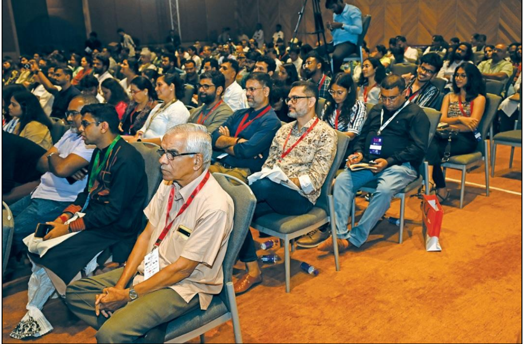
The IIA Young Architects Festival, YAF 2024, took place at Alila Diwa Resort at Goa, with the theme transitioning from 'Interpreting the Vernacular' to 'Inspirations from the Vernacular'. The event, held on 27 – 28 September 2024, generated great energy and enthusiasm from Team IIA Goa.