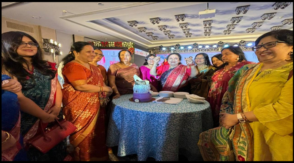
IIA JHARKHAND CHAPTER