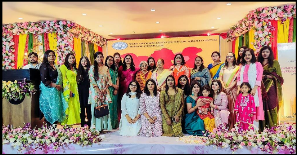
IIA BIHAR CHAPTER