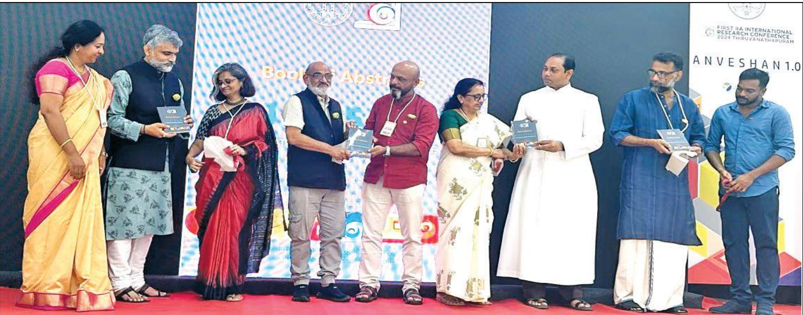
The first Research Conference held by the IIA Research and Development Committee took place at Marian College of Architecture and Planning (MCAP), Thiruvananthapuram on 29 to 31 August 2024. The name of the conference was ANVESHAN, means to investigate, to find out.