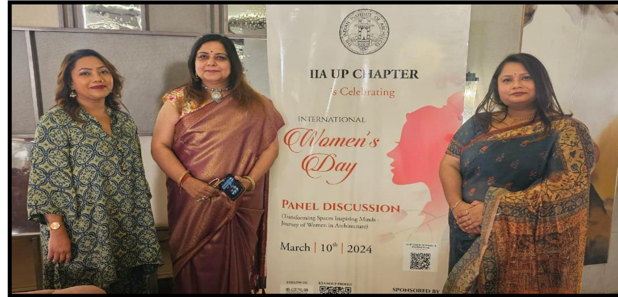
IJA UTTAR PRADESH CHAPTER