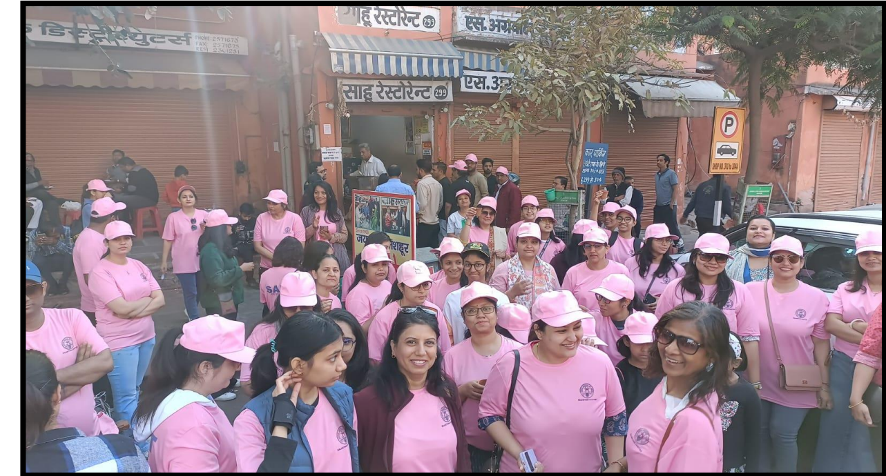
IJA RAJASTHAN CHAPTER