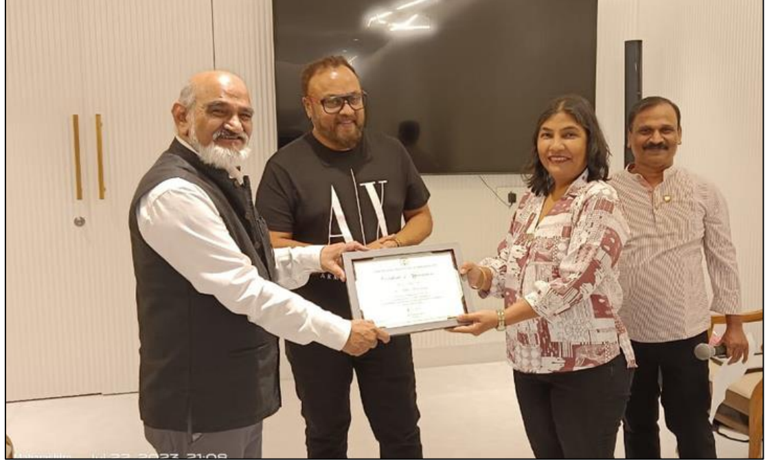
Fellowship Dinner was arranged on Saturday, 22 nd July, 2023 evening at the Garware Club House, Wankhede Stadium, Mumbai, Maharashtra where the Certificates of appreciation, were distributed amongst the elected Members of the IIA National Council for the term 2023-2025.