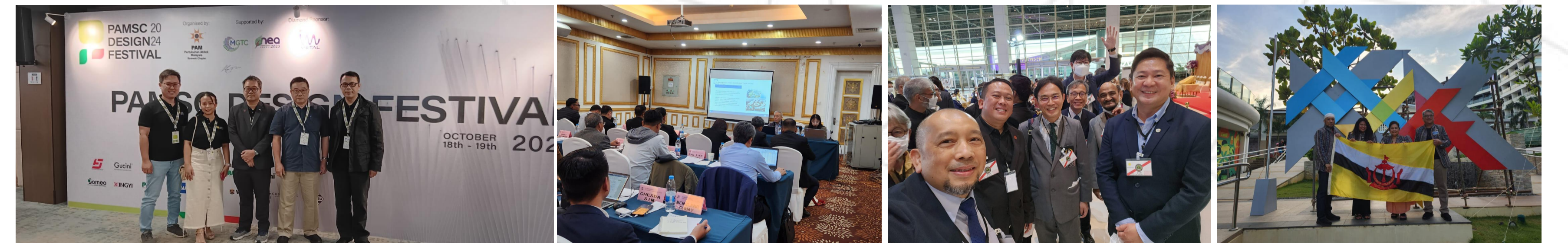
Members attendance at overseas Architectural conferences and events 2024