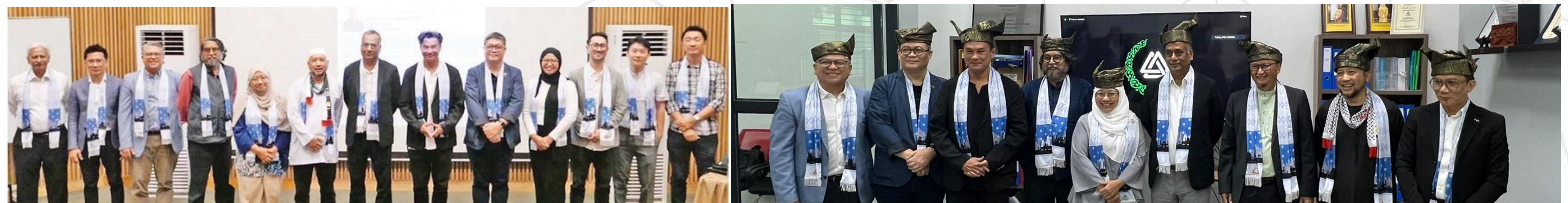
ARCASIA's ACAE-ACSR Cross-Committee Roundtable event Dec 2023 ( 1st ever ARCASIA event hosted by IAPB in Brunei)