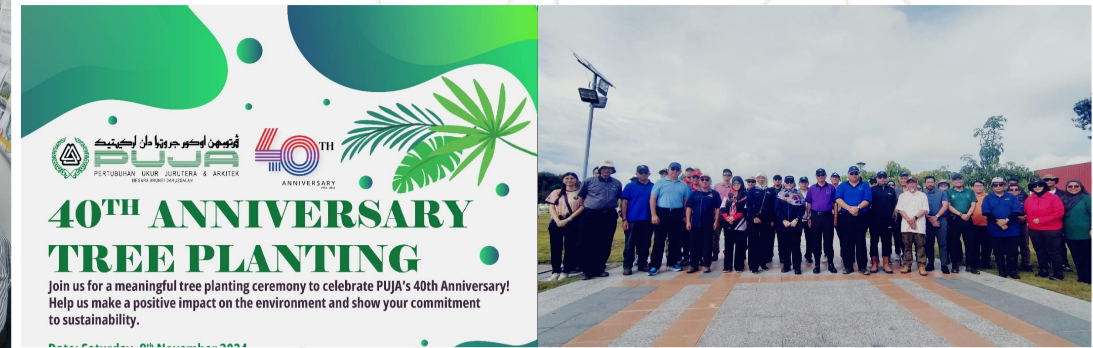
Contributing to the Community, PUJA 40th Anniversary Tree Planting Event at TMJE, 09th November 2024