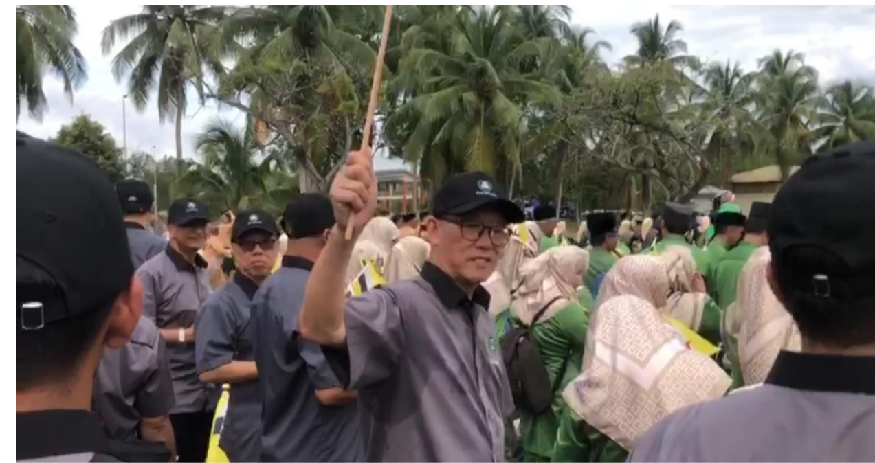
PUJA committee & student members out on full force for the Brunei 40th National Day Parade. 23rd February 2024