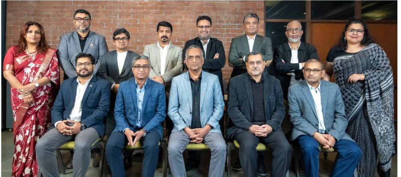
Photograph of 26th Executive Council (for the term 2025-2026)