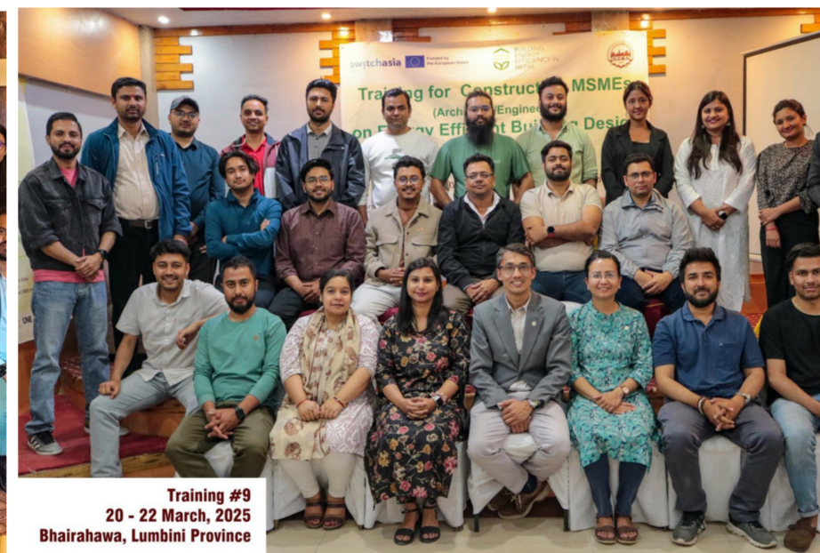
Training #9 20 - 22 March, 2025 Bhairahawa, Lumbini Province

The Society of Nepalese Architects (SONA), in partnership with BUILDING Energy Efficiency in Nepal (BEEN)—a project funded by the European Union under the Switch Asia grant programme successfully conducted the session of 3 days each on nine different places of Nepal on Inclusive Energy Efficient Building Design. The programme covered key aspects of energy-efficient and inclusive design, with hands-on demonstrations of rat-trap bond masonry and insulation techniques for walls and roofs. Participants also analyzed buildings through simulations and case studies to explore effective measures, tools, and materials for enhancing efficiency