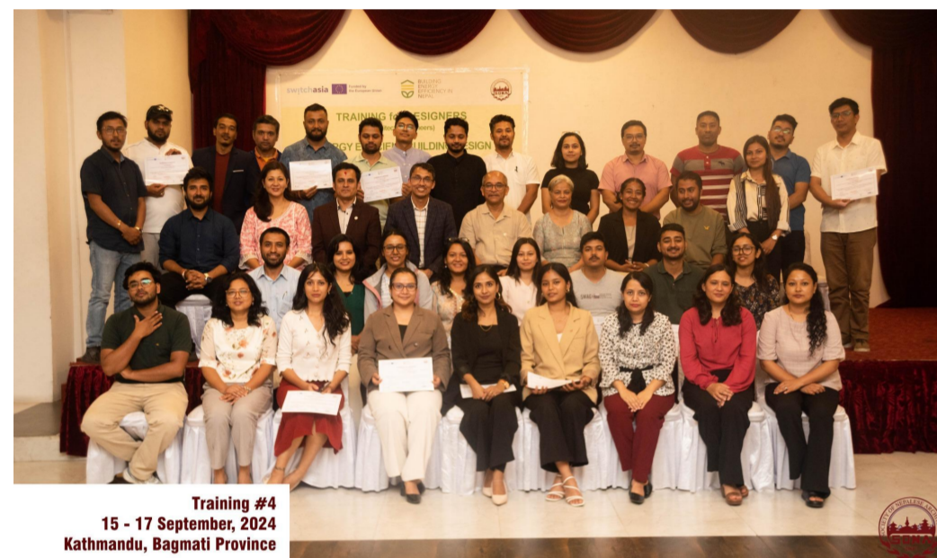
Training #4 15 - 17 September, 2024 Kathmandu, Bagmati Province