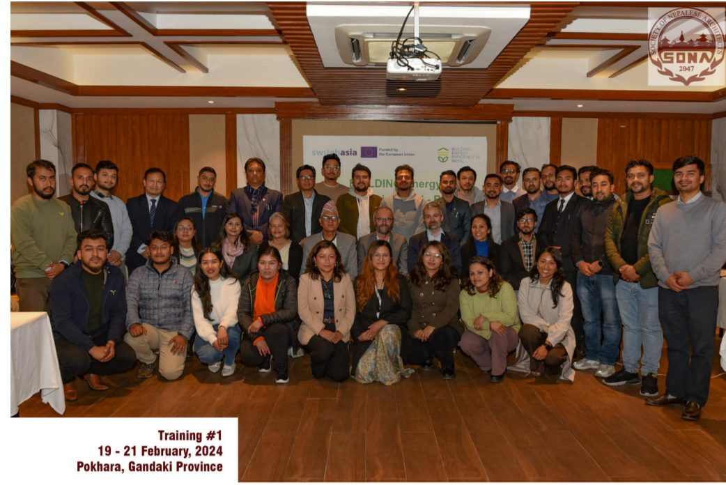
Training #1 19 - 21 February, 2024 Pokhara, Gandaki Province