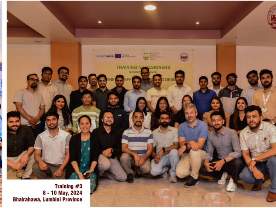
Training #3 8 - 10 May, 2024 Bhairahawa, Lumbini Province