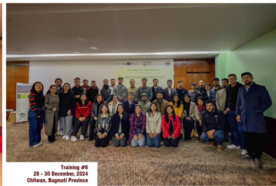
Training #6 28 - 30 December, 2024 Chitwan, Bagmati Province