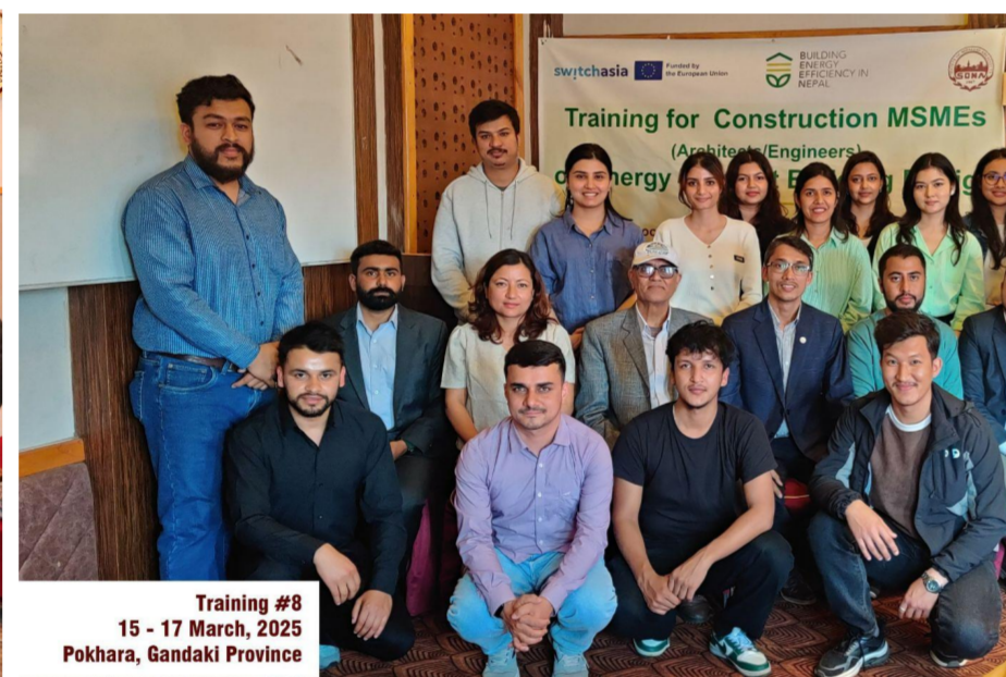
Training #8 15 - 17 March, 2025 Pokhara, Gandaki Province